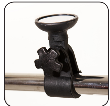
Navisafe Telescopic Pole